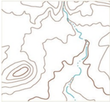
Figure 7-E2 | Portion of a topographic map showing contour intervals.

For Questions 9 through 13, refer to Figure 7-E2 below, which shows a hill, an intermittent stream, and two index contours (darkened contour lines). Assume the contour interval for this map is 5 m, and the index contour that is crossing the stream has an elevation of 70 m. Review overview section 7.3 prior to doing this exercise.